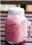
NOM YEN ICED PINK MILK