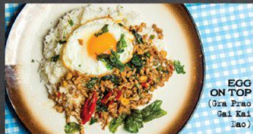
EGG ON TOP (Gra Prao Gai Kai Dao)