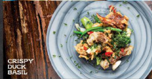
CRISPY DUCK BASIL