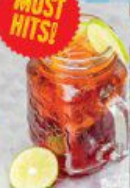
CHA MA NAO THAI LEMON ICED TEA