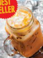
CHA YEN THAI MILK TEA