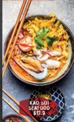
KAO SOI SEAFOOD $17.9

KAO SOI LAKSA-LIKE NOODLE SOUP : EGG NOODLES & CRISPY EGG NOODLES IN COCONUT BROTH