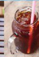
CHA DAM YEN THAI ICED TEA