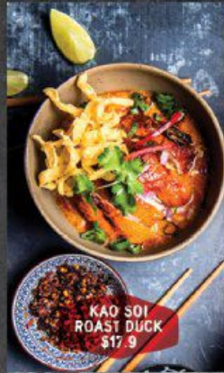
KAO SOI ROAST DUCK $17.9

GRILLED ROAST DUCK, EGG NOODLES, VEGETABLES $17.9