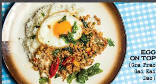
EGG ON TOP (Gra Prao Gai Kai Dao)

CASHW NUT Chilli jam, veggies, cashew nuts