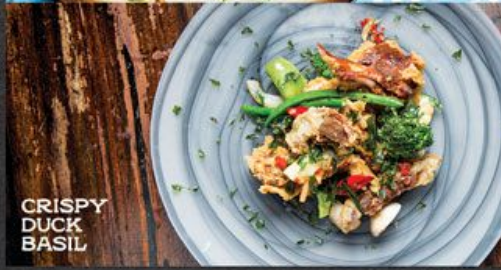
CRISPY DUCK BASIL