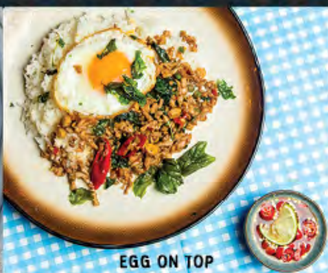
EGG ON TOP