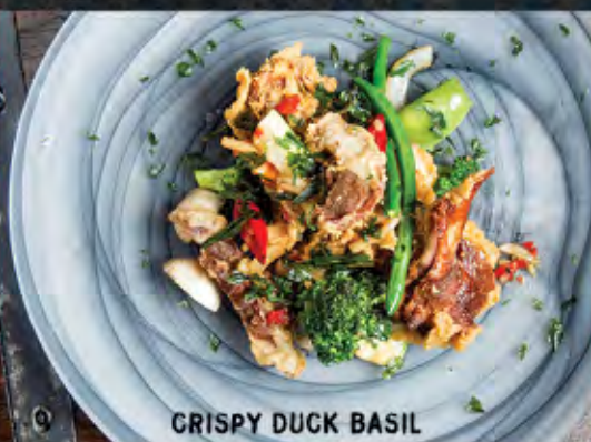
CRISPY DUCK BASIL

Stir-fried battered duck, chilli jam, veggies, cashew nuts