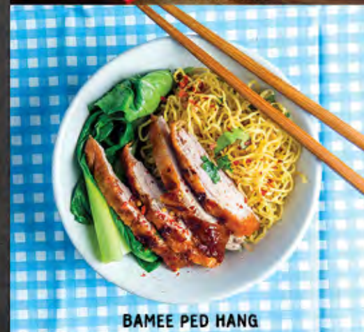
BAMEE PED HANG