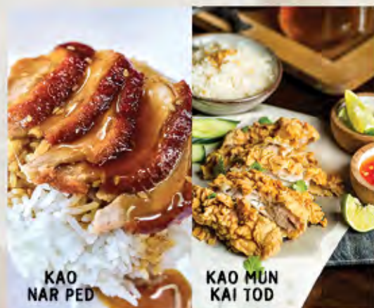
KAO NAR PED