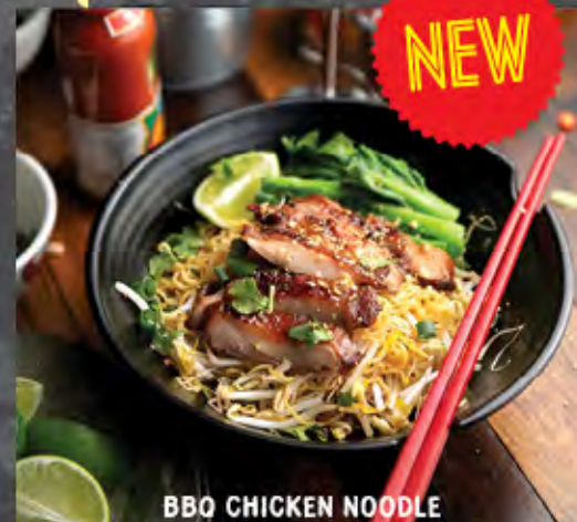
BBQ CHICKEN NOODLE

Served w/pickle cabbage & roasted chilli.