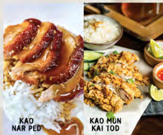
KAO NAR PED