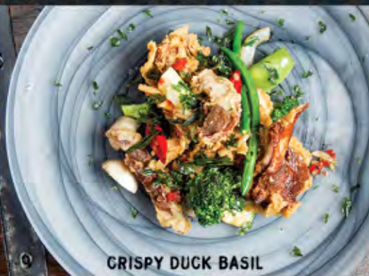
CRISPY DUCK BASIL

Stir-fried battered duck, chilli jam, veggies, cashew nuts